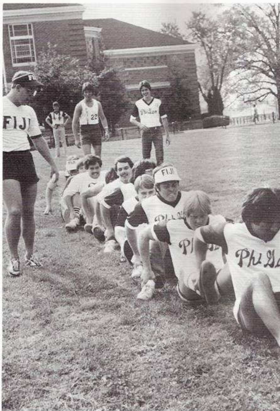
Brothers form a caterpillar in competition in Lion's Roar sponsored by Phi Mu.

In only a short period of time the Delta Colony at Tennessee Tech has made for itself a history of which to be proud. However, we will not rest on our laurels but continue to strive to become the best fraternity we can. The past is there to encourage us, to give us confidence, and to say "carry on" so that the future may be even brighter.