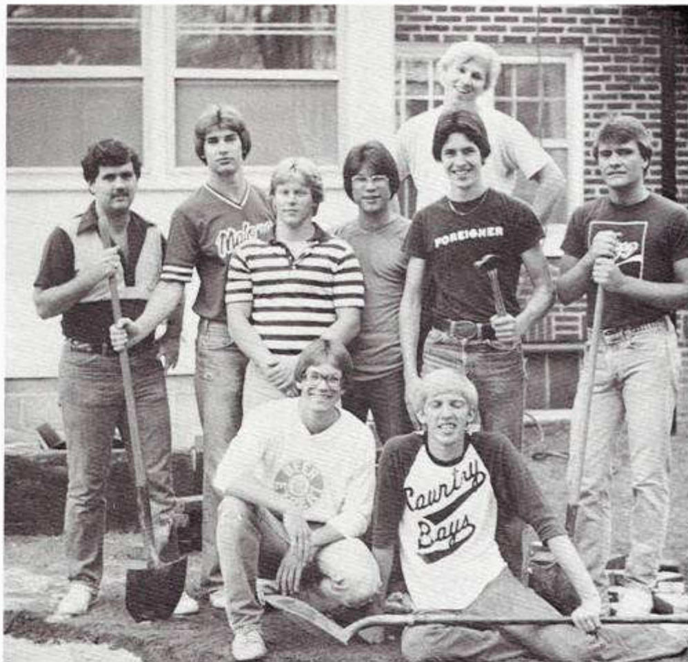
Spring 1980 pledge class.

all projects, the Big Brother program, Fraternity information and special speakers, and the study hall and work duties. It is the responsibility of the chairman to be sure the program is run responsibly and that the Colony is