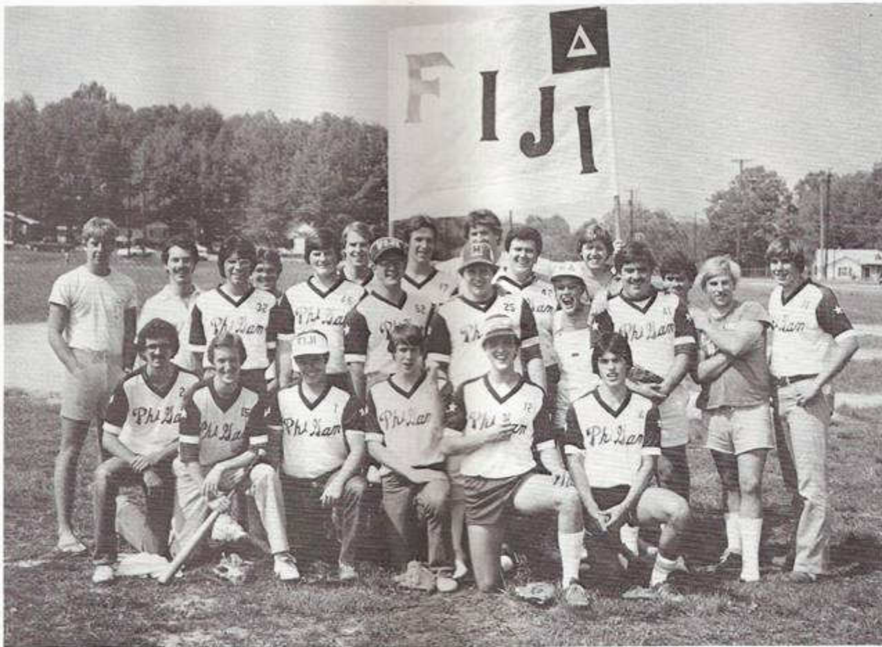
The 1980 softball team finished third place in the division.