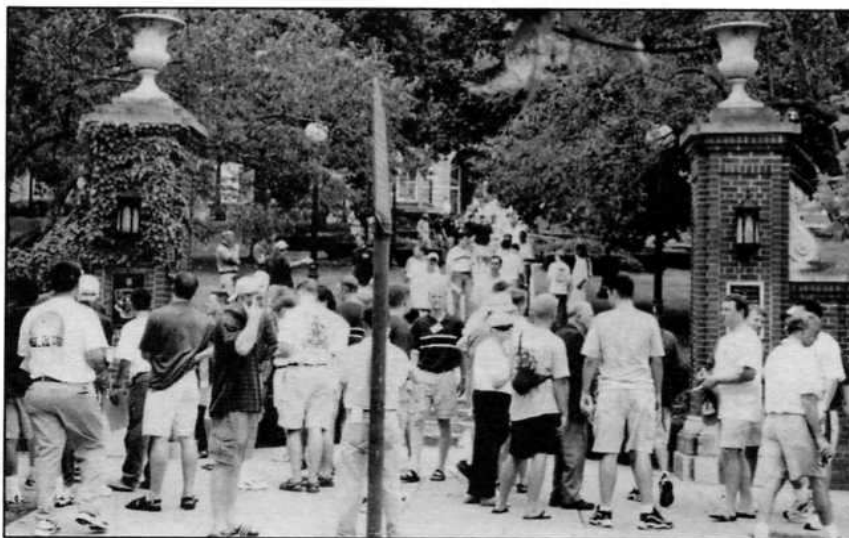
Gates to Washington & Jefferson College above