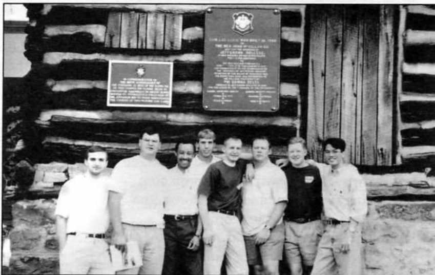
Theta Tau Brothers at the Log Cabin

If you are planning ahead, in 2000 we go to San Antonio, Texas for the Ekklesia!