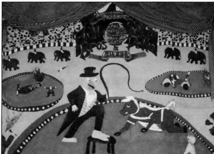
Our banner we created for the circus theme, won for us the 2 nd place award.

This makes the second year in a row that we have won Homecoming. Last year we overtook the rest of the Greeks alongside Alpha Delta Pi. This year we succeeded once again.