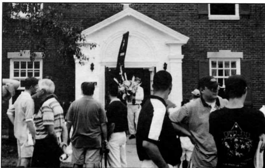
Alpha Chapter below