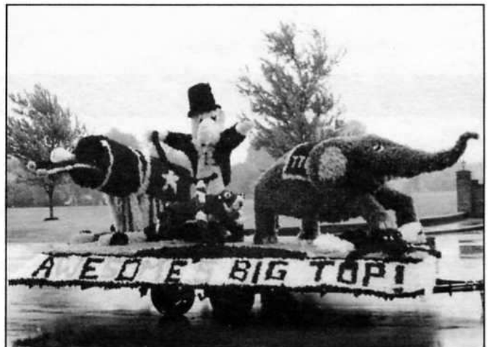
After a weeks worth of pumping, chicken wire, and glue, winning first in float felt great!