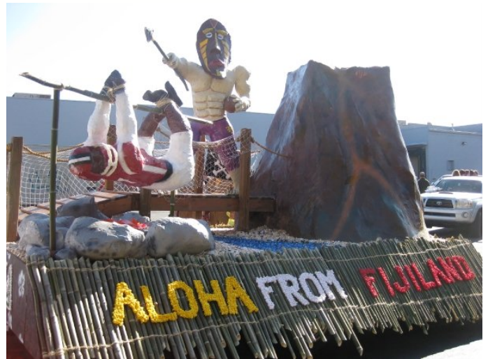
Fiji /KD float Wins 1st Place in the float competition!

Thanks to all the graduates who were able to make the trip and attend Homecoming! For everyone who wasn't able to attend this year, we hope to see you at the 28th Anniversary Pig Dinner and FIJI Homecoming 2009!