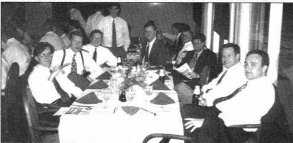
Below: Some of the Grad Association