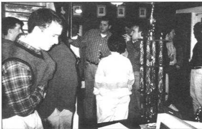
The Graduate Reception Friday Night