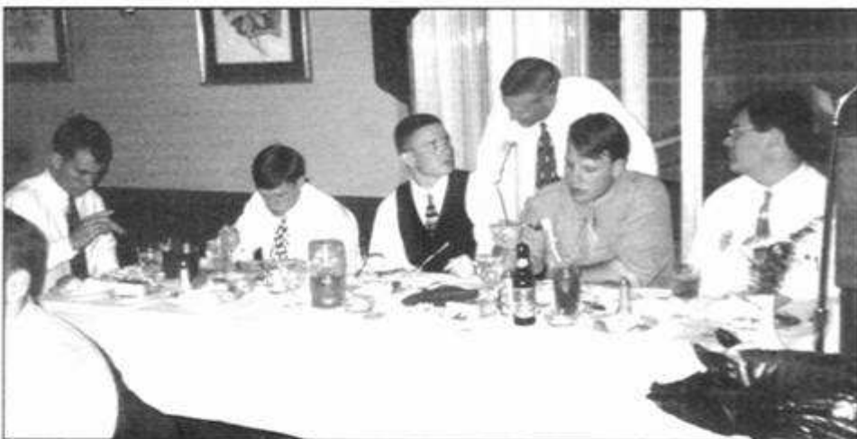
Above: '98 Cabinet and the PD Chairman

The Pig Dinner Committee would like to thank everyone who attended this Pig Dinner and we hope to see you again at Homecoming.