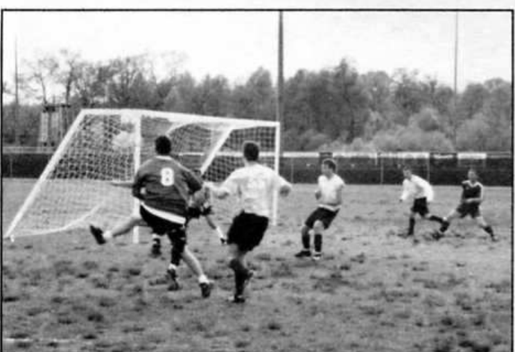
Fijis on the soccer field

Phi Gam swept the competition on the soccer field taking first place in IFC soccer.