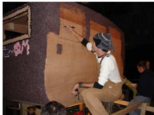
A stage coach worthy of Phi Gamm

We also placed third in the float competition. We appreciate all the graduates that showed up for homecoming and helped out; your efforts were well awarded and appreciated. Also, Kazoo Band again won first place for the open division parade contest. This wacky group of Fiji's never ceases to be the talk of the parade. Dressing up in whatever random array of outrageous apparel you can find and running through the streets screaming and singing to girls. The crowd is never disappointed with the spectacle. We always the enjoy the sentimental graduates that run with us. This year we even had the Shoney's Bear run with us this year.