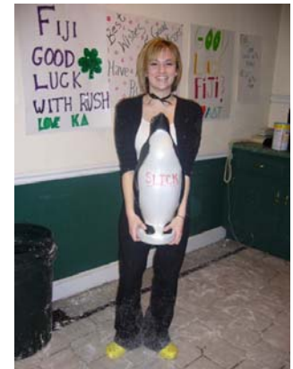
We even had a few penguins at arctic night