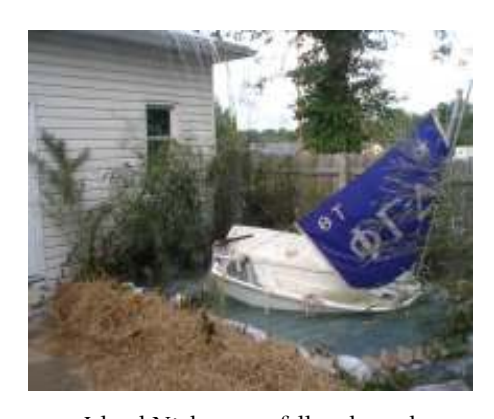
Island Night waterfall and pond