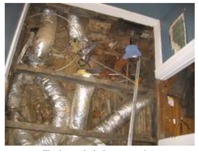
The downstairs bathroom gutted.