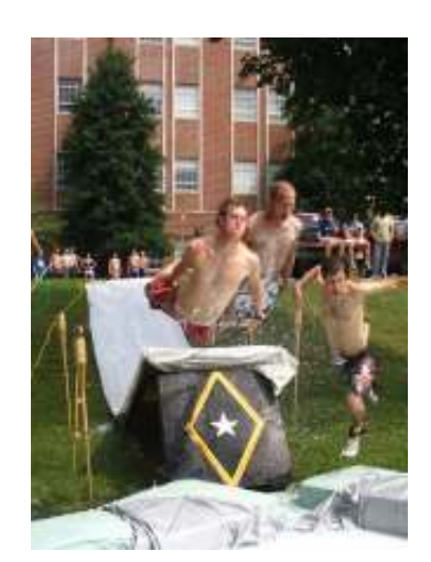
Brothers enjoy the slip 'n' slide