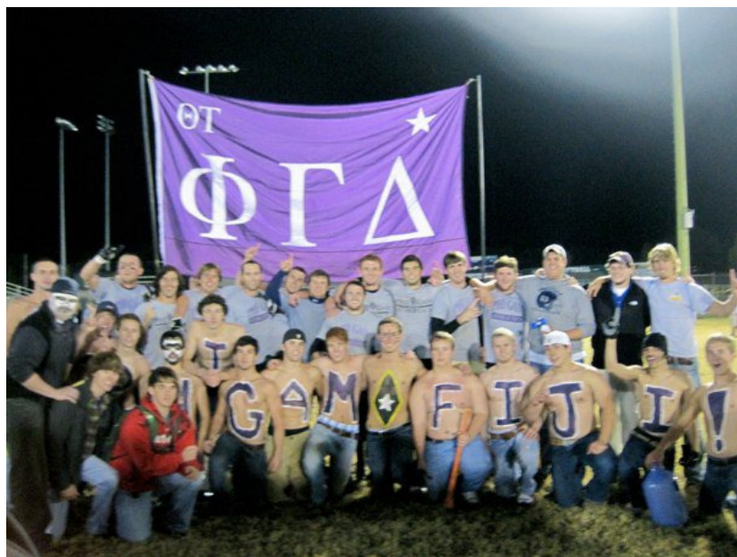
The Phi Gamma Delta Championship-winning flag football team and fans