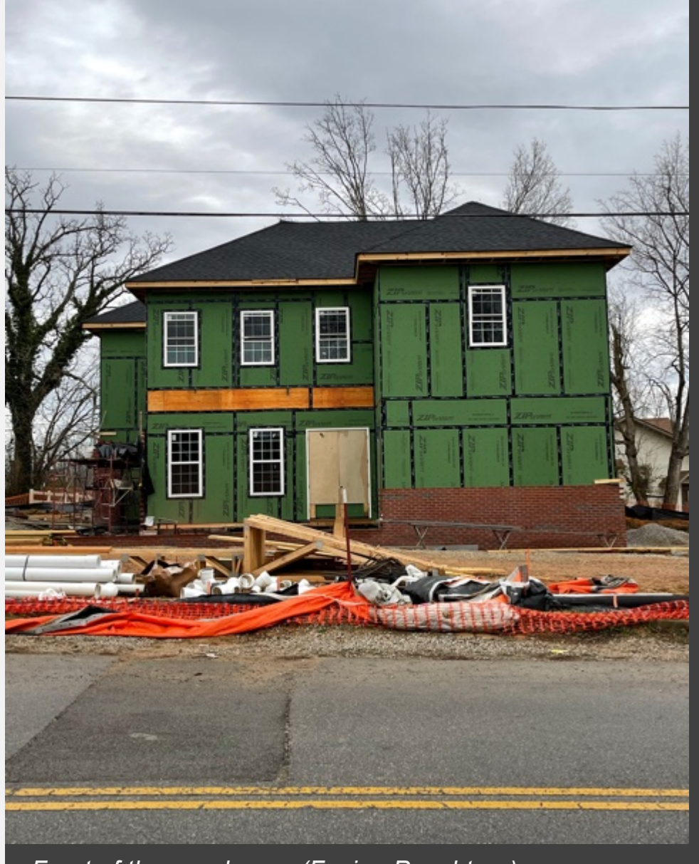
Front of the new house (Facing Peachtree)