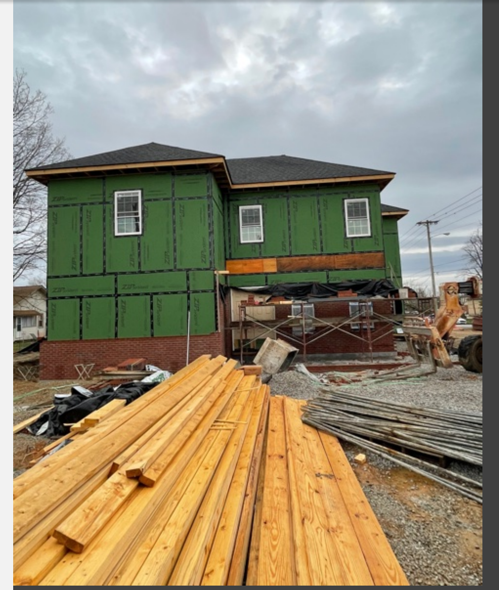
Left side of the new house (From Peachtree)