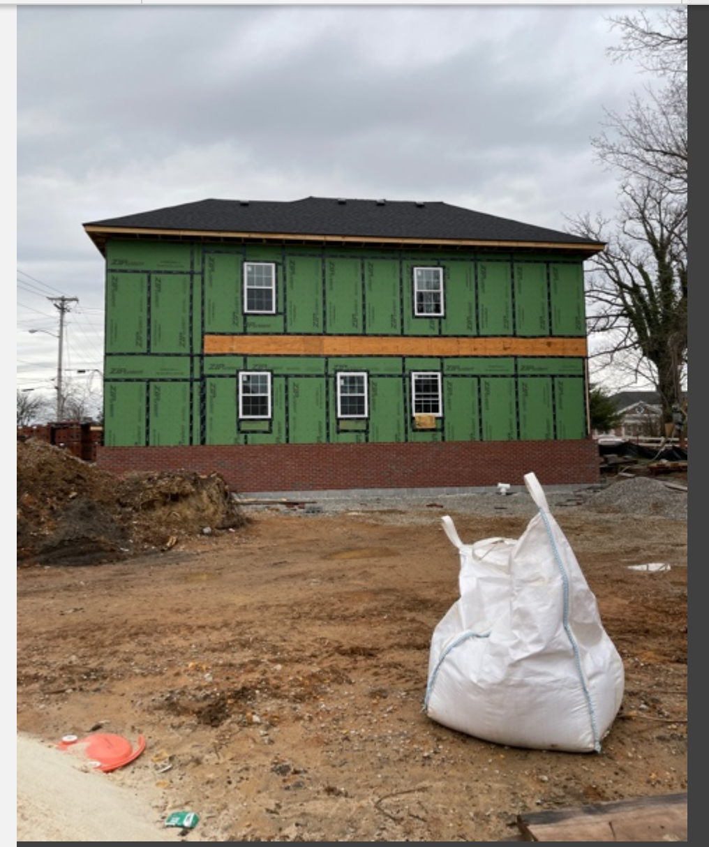
Right side of the new house (From Peachtree)